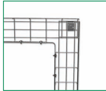
Zero Radius 90 Degree Bend